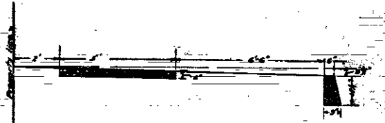
SECTION OF SIDEWALK AND CURB AT A-A SCALE 1"=1'